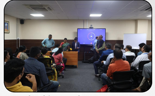
Leadership Development Program