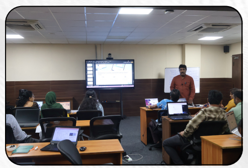
Digital Marketing Workshop